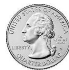
Quarter a 25-cent coin

mutilate = cut off a person's body organs such as limbs limb = arm or leg