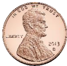
Penny a one-cent coin