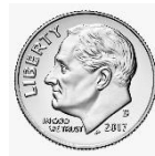
Dime a ten-cent coin