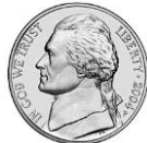
Nickel a five-cent coin